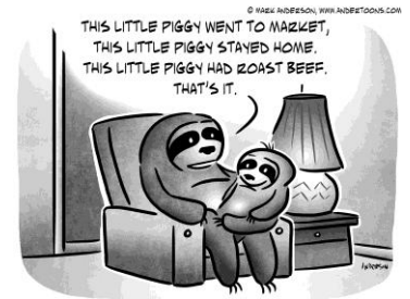
Nursery rhymes of the three-toed sloth.